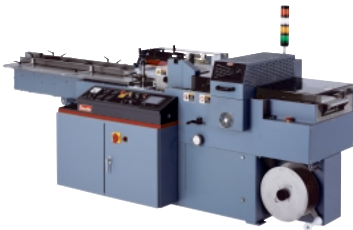
Shanklin Hy-Speed Series