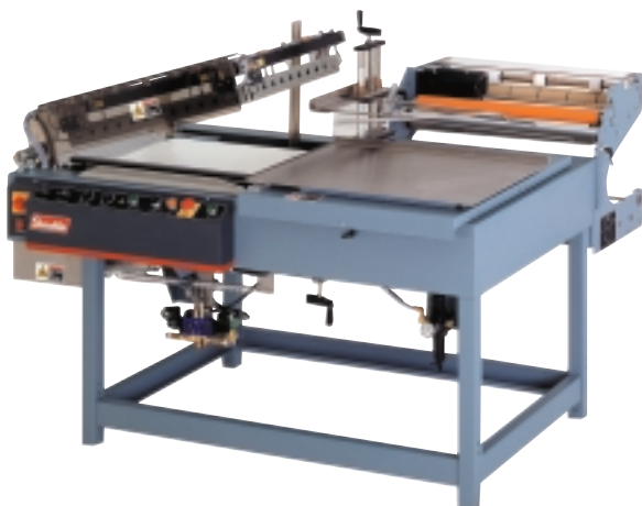
Shanklin Automatic L-Sealer Series