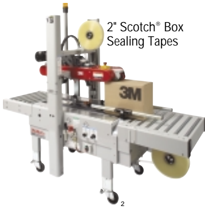
2" Scotch® Box Sealing Tapes