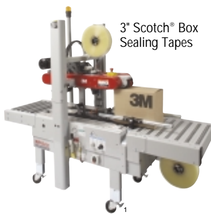
3" Scotch® Box Sealing Tapes