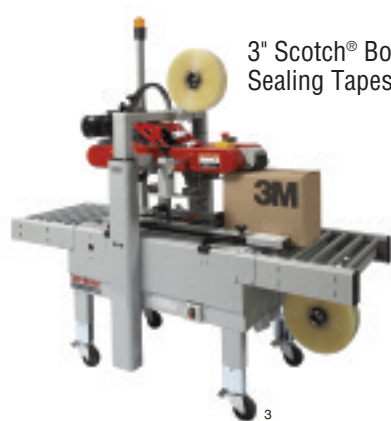
3" Scotch® Box Sealing Tapes