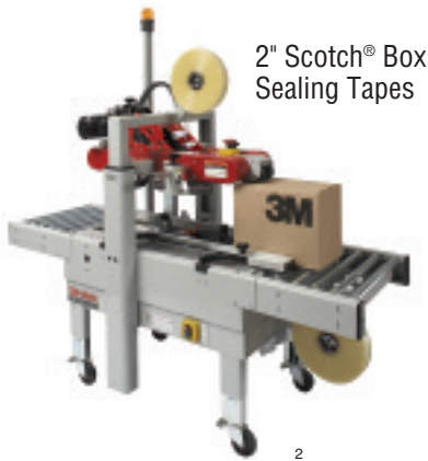
2" Scotch® Box Sealing Tapes